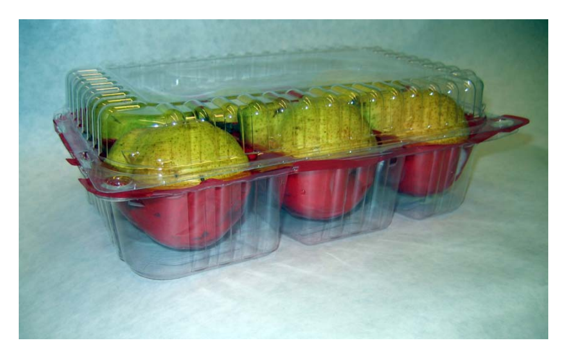
Figure 2. Photo of suspended tray clamshell package (Hammock pack) used in test

where the fruit touched the plastic near the junction of the top and bottom sections of the clamshell.