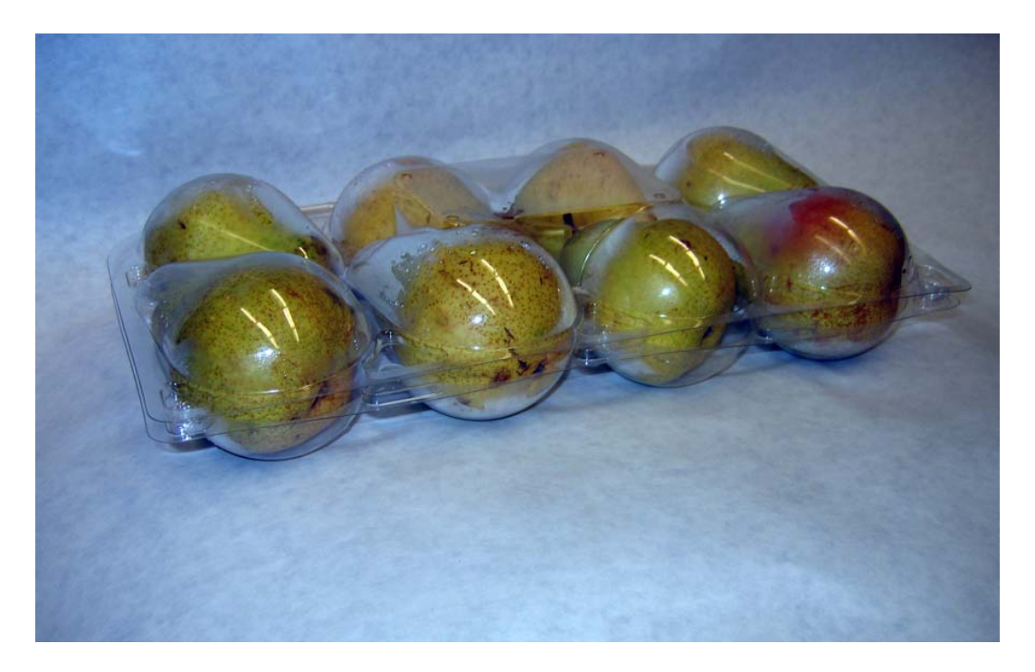
Figure 3. Photo of standard clamshell package